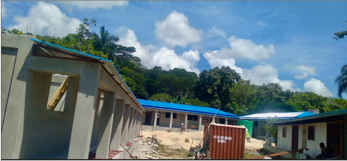
St. Marc Elementary School is nearing completion!

Our desire is to provide the best learning environment possible for our students. We continue to rebuild following the 2010 earthquake. Because of your generosity and God's provision, we are making great progress. To date, 18 schools have been rebuilt with several others being repaired. There are a few more to go! If you have a heart for construction, please give to our Construction Fund so that we can complete our goal. If you are aware of any grant opportunities, please let us know. There are no words for the joy experienced by a community that receives a new school building. Not only do our schools provide education; they serve as shelter in storms, meeting places for the community, and a weekly place of worship.