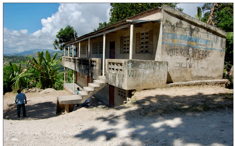
St. Barthelemy as it is today.

HEF's goal for 2026 is to rebuild St. Barthelemy School in Bahot. This building was damaged by the earthquake in 2010. Several years later, another small earthquake further damaged the walls. The new school will have 12 classrooms and a director's office. We hope to begin construction after the first of the year. The new school will cost approximately $300,000.