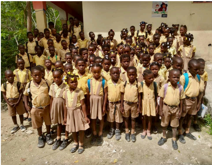
Elementary students lined up for photos at St. Etienne, La Mothe.