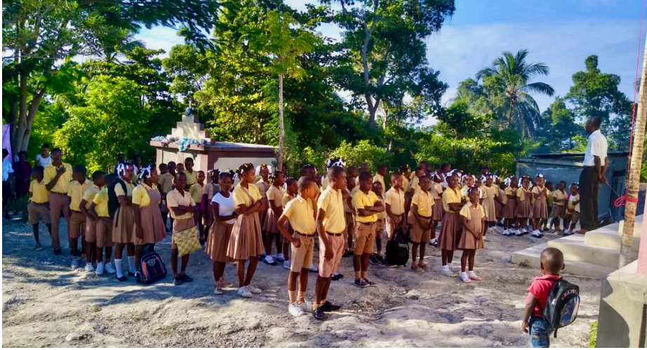
Students lining up for morning prayer and pledge at St. Innocents School, Bellevue.