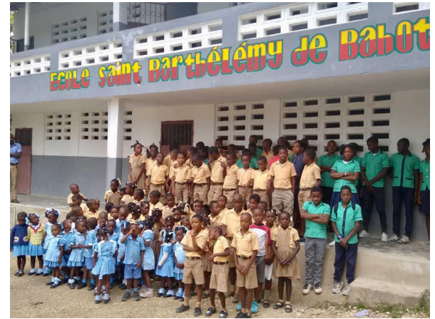
Kindergarten through 7th graders pose in front of their school, St. Barthelemy, Bahot.