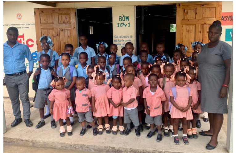
Transfiguration School is new to our sponsorship. They currently educate children in K – 3rd grade.