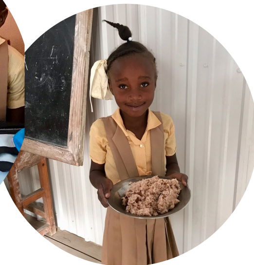
Trinity Hope Feeding