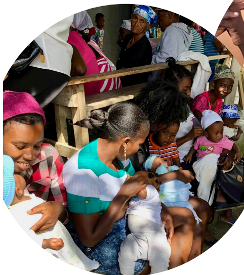
Haiti Healthcare Partners