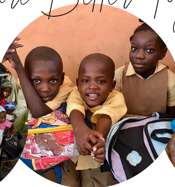
Haiti Education Foundation