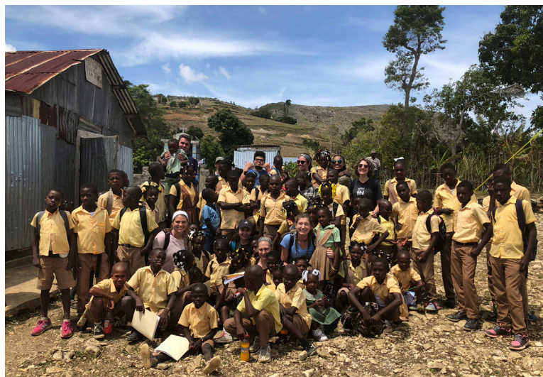
FPC Ft. Smith enjoyed a visit to their sponsored school over spring break. Fun for all!