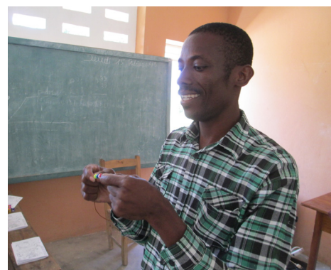
The principal at Marigot explains the salvation bracelets to the students.