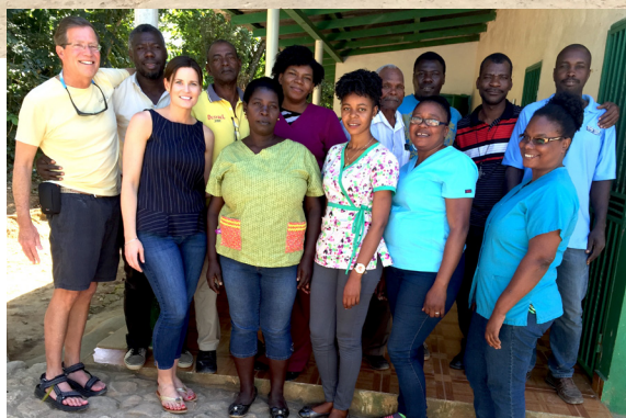
Members of the clinic team in Cherident meet with HHP representatives.