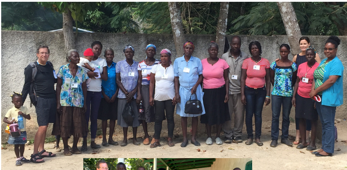
Members of Haiti Healthcare Partners with matrons who are working with expectant mothers in Grand Colline and surrounding areas.