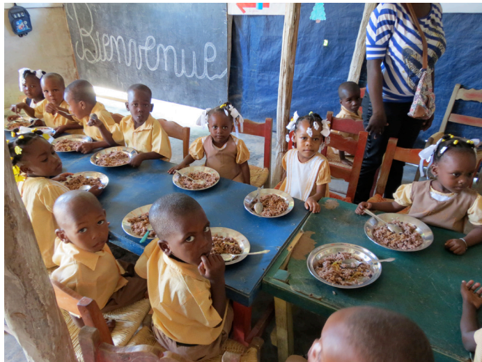
Children at St. Innocents, Bellevue enjoying lunch. FPC Johnson City, TN, partners with Trinity Hope to make this possible.