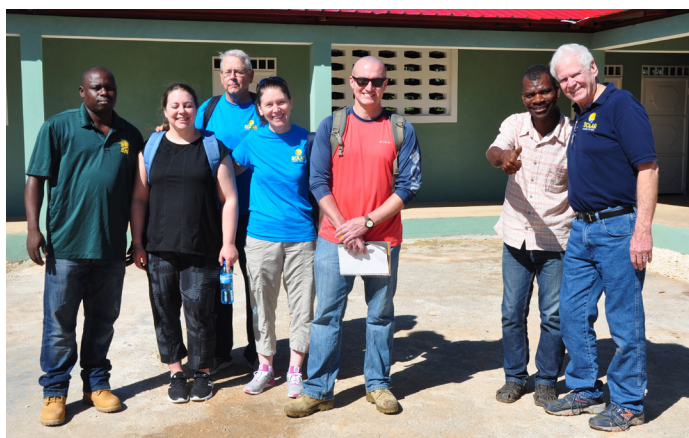
FPC Ft. Worth at St. Matthias High School surveying the solar needs for the school.