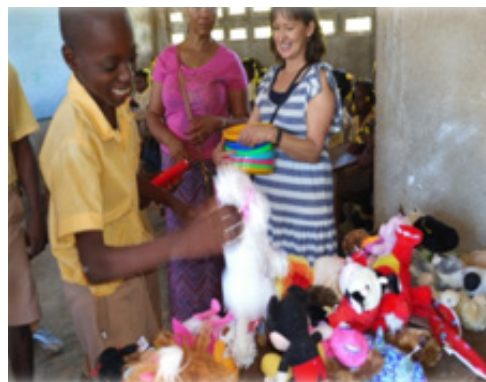
Raleigh Court Presbyterian church members sharing stuffed animals with the children at The Allison School in Larevoir.