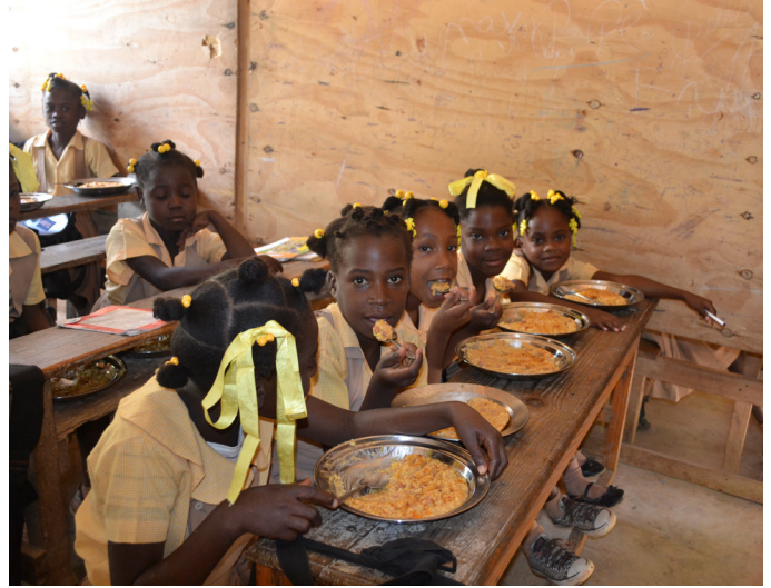
FPC, Shreveport team experiences Trinity Hope feeding program with their elementary students at St. Matthias School in Cherident.