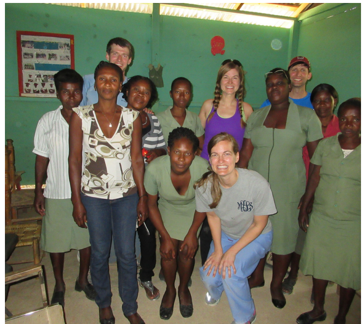
St. Matthias preschool teachers meet with their sponsoring church team from St. Paul's Episcopal Church, Shreveport, LA.