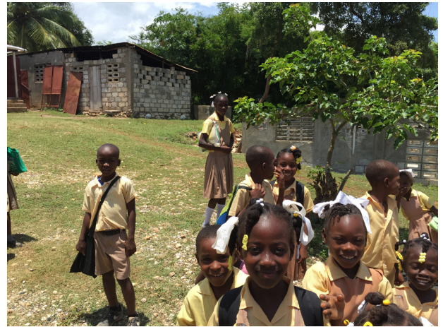
Students of St. Luc School which will be rebuilt within the next year!