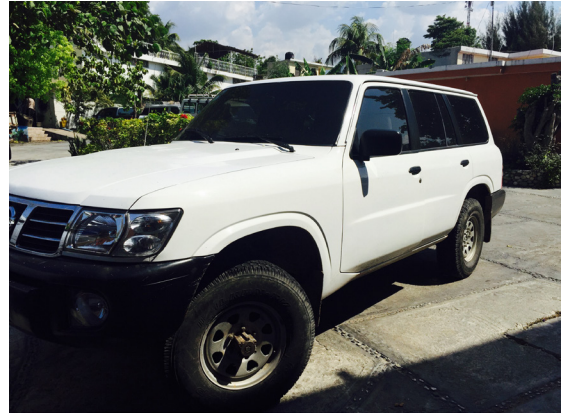
The new vehicle purchased to carry our missionaries to and from the airport and into the field.

Additionally, we would like to thank First Presbyterian Church in Gainesville, GA, for raising funds to rebuild the school that they sponsor, St. Joseph D'Armathe in Pillard. Their school was completely destroyed in the earthquake of 2010.