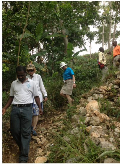
The hike to Epiphanie School is a steep one!