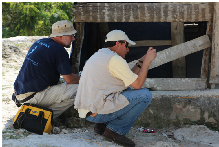
Lots of projects to look at...