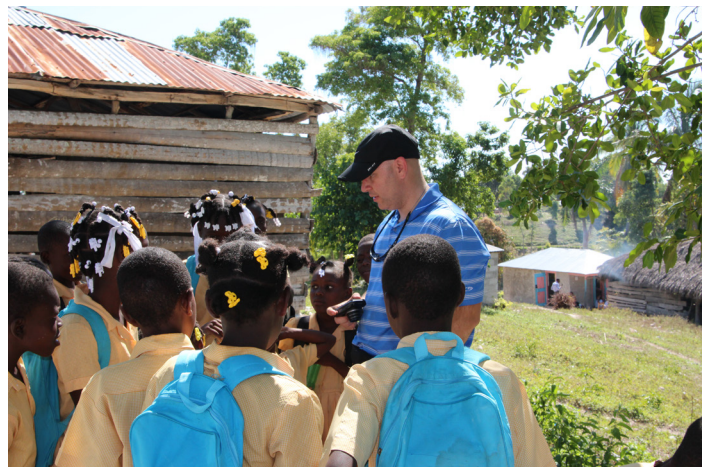
The children love having their pictures taken....and seeing what they look like!