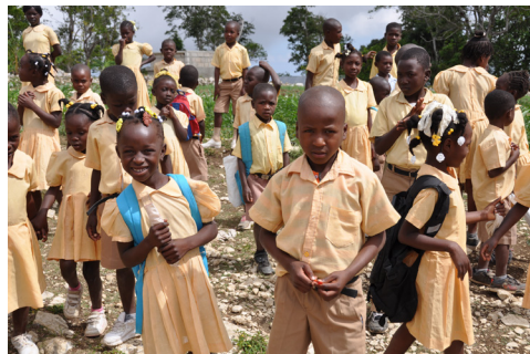
We love school!