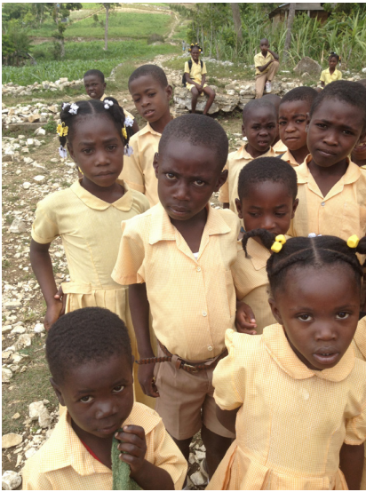
Students at the Epiphanie School in Morin, St. Matthias Parish.