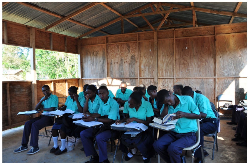
Students at the Terminal II school in Cherident

Haiti Education Foundation, Inc. P.O. Box 10775, El Dorado, AR 71730 870-862-1252 www.haitifoundation.org