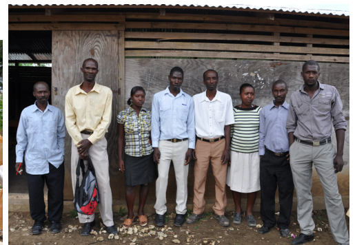
Principal and Teachers at Epiphany