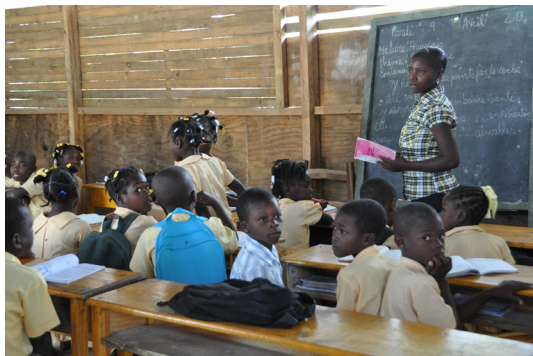
Second Grade Class