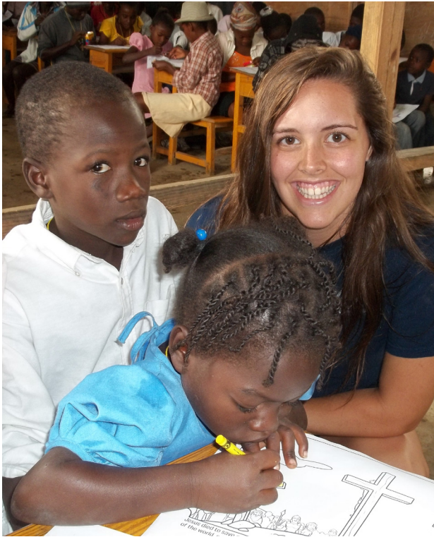
Spending time with our students.