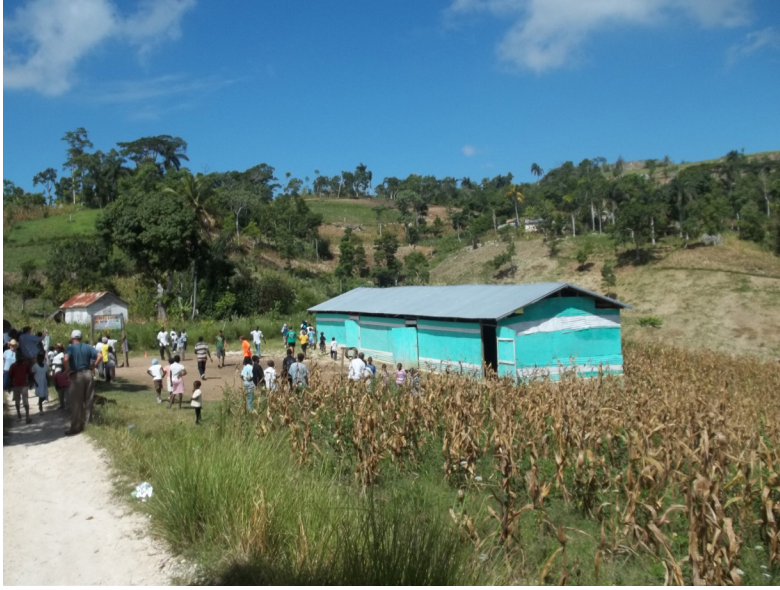
Notre Dame School in David, Haiti.

Windy Cove Presbyterian Church of Millboro, VA sent a thirteen member mission team to Haiti to enjoy a week in the beautiful mountains in the Cherident area. The team traveled to Haiti for many reasons but of utmost importance was to begin to develop a working relationship with our “adopted” school at David. Windy Cove began sponsoring the Notre Dame school at David shortly after the annual HUG conference last October. From that point on our church began praying for that school and the community of David. We also united in prayer as to how our mission team could effectively assist our school and the students who attend there. We decided that not only should we financially support them but we should also show our support by visiting them and getting to know the children that attend the school. After three separate meetings our team decided to construct new school benches, collect school supplies to take with us and have a three-day