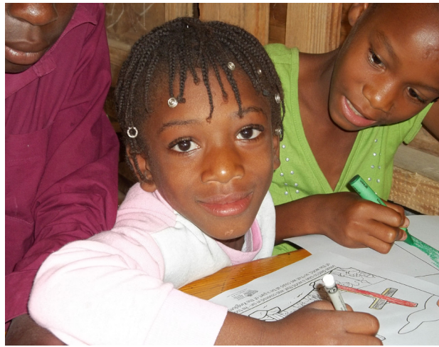
Having fun at VBS...It's universal!