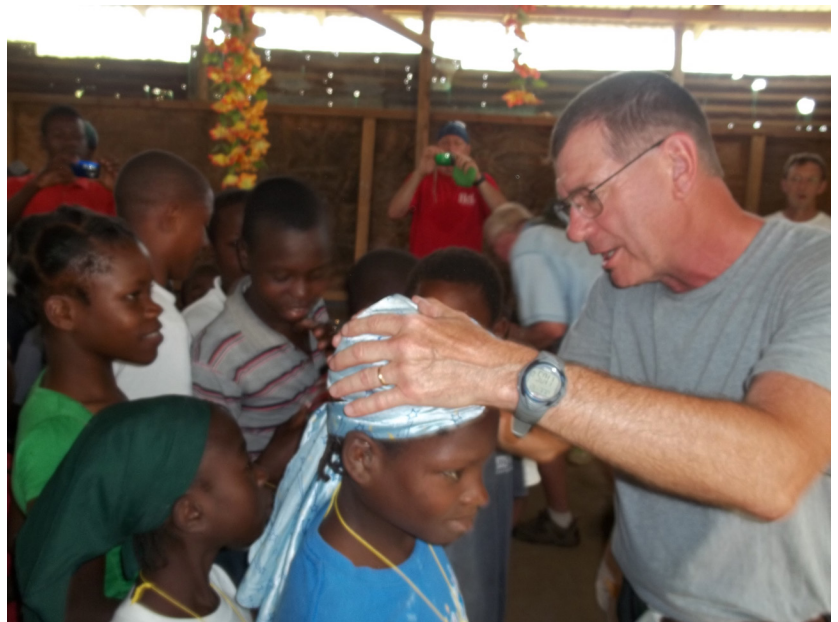
Getting ready for a Bible story skit.