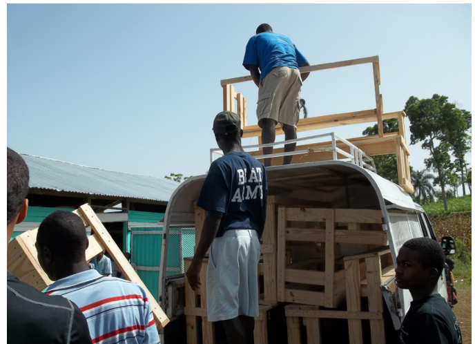
Unloading benches that we built for the classrooms.

In the following days our visits to the school focused on VBS and activities with the children. Our four teens of the group planned and taught the Bible stories about Paul and Silas, the birth of Jesus and His crucifixion and resurrection. They included many of the Haitian children in the stories and performed a drama for each story. The team also helped the students create a craft activity that was about the Bible story for that day. The last day of Bible school was delivery day for the fifteen school benches that the team had constructed. It was quite a task to load all of the benches on two trucks and not lose one transporting them to the school --- but --Haitian ingenuity never fails!! After delivery of the benches our entire team helped teach the Bible story for the day and create a craft that further explained the Bible story. After Pastor Rob Sherrard sent the students out with a personal blessing each child was brought back in to the school to receive a treat bag and a new outfit. The children and the principal were extremely happy with all that our team had done for them. The children sang to the team to show their appreciation for all that we had done. Words cannot express how humbled we felt during this time. We went to Haiti to bless this little school out in the middle of a corn field with material blessings that might make their school days easier. But, they blessed our team beyond measure with the smiles and love that was shown to us during our visit in David.