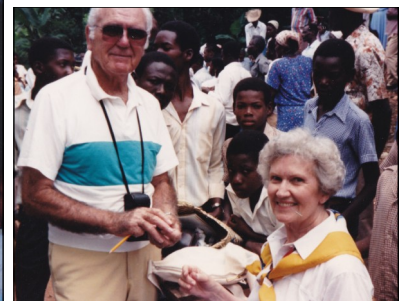
The Landers visit one of the HEF school villages.