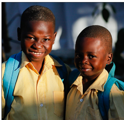
Proud students in Cherident

This is a song the children sing as they walk over the mountains to school or church.