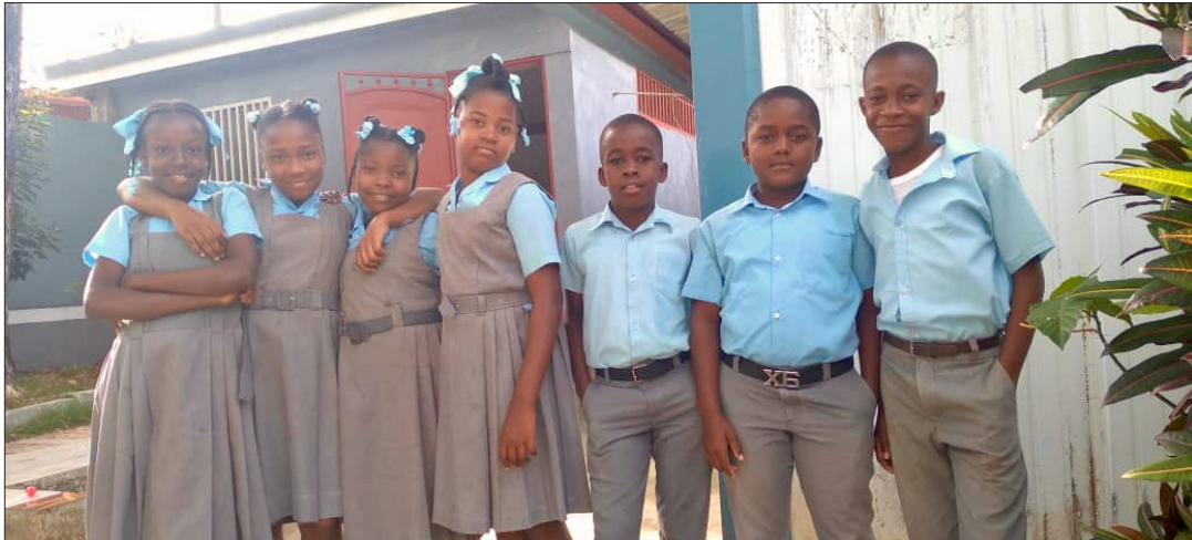
Haiti Education Foundation