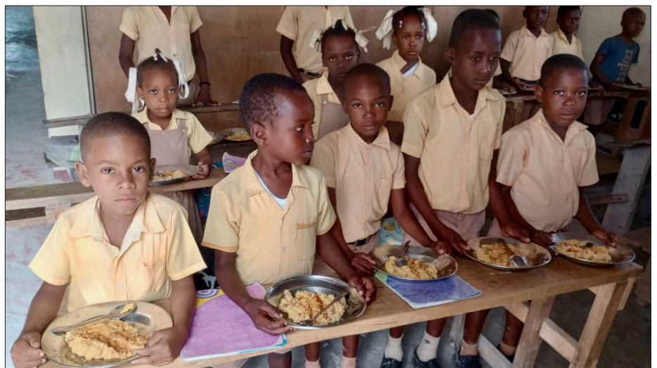
Trinity Hope Feeding