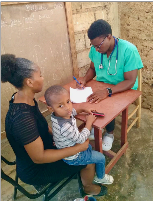
Haiti Healthcare Partners