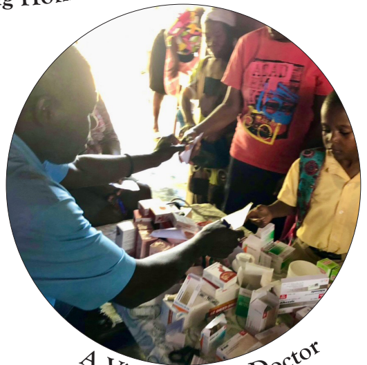
A Visit with the Doctor