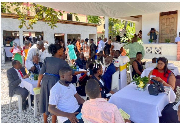
Former students of Ascension School gather for lunch during the Ascension Day celebration. They return to visit, reminisce, and encourage the people of the community.