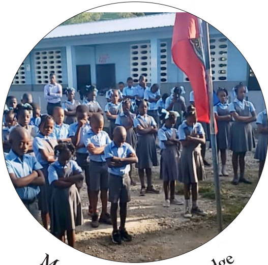
Morning Prayer & Pledge

W e partner with the Haitian Episcopal church, funding 35 schools in five parishes. Your donations fund salaries for 669 teachers and staff. Enrollment for the 2022-23 school year was about 7,190 students and we anticipate similar numbers this fall. Four schools are kindergarten through 12th grade. Ten schools are kindergarten through 9th grade. In 21 villages, schools are kindergarten through 6th grade.