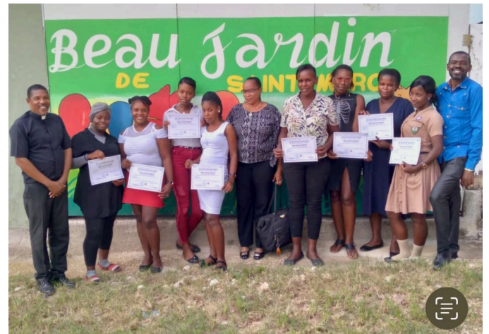
Having completed teacher training over the summer, our educators are confident to return to the classroom.