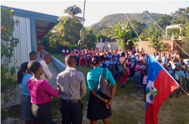
Teachers look on as students lead the opening prayer and pledge to start their school day.