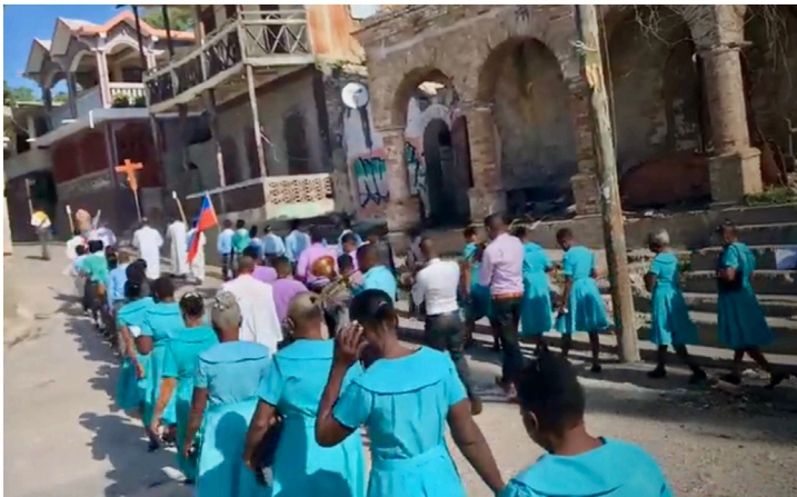
Church leaders lead the choirs and congregations through the streets of Beinet to the Ascension Church for a celebration of Ascension Day.